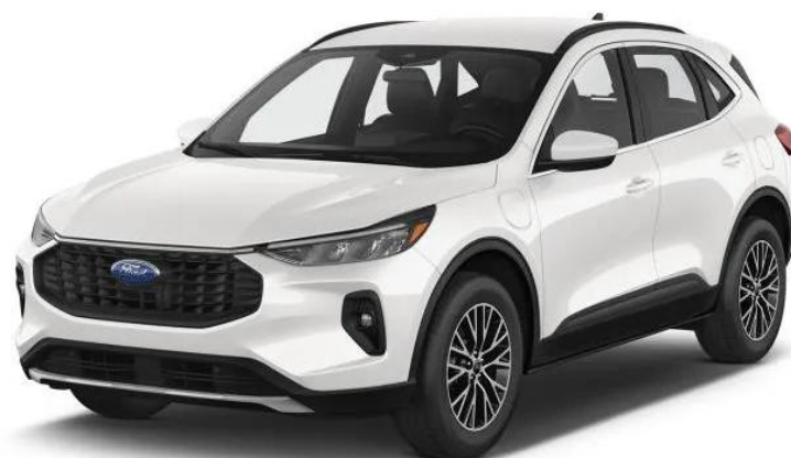
Mid Size SUV